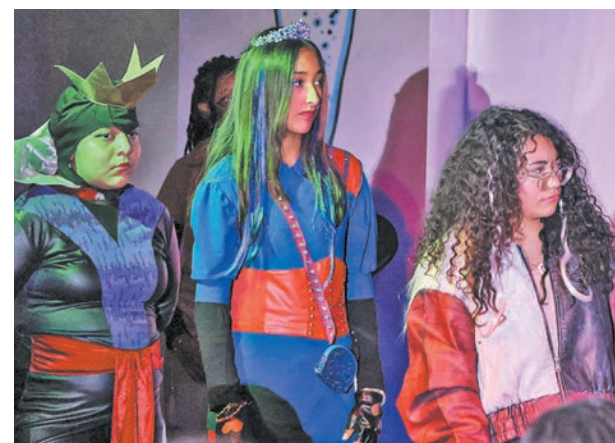
The Valence Prep debate team (top) won New York City Urban Debate League's top team award last spring, while the theater troupe, the Narwhal Players, performed the musical "Descendants" last May.

"Our first two productions occurred over Zoom during the pandemic, and since then, we've produced four one-act plays and